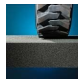
High compressive strength