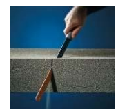
Easy cut to shape