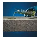
Acid resistant / chemical resistant