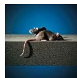
Resistant to attack